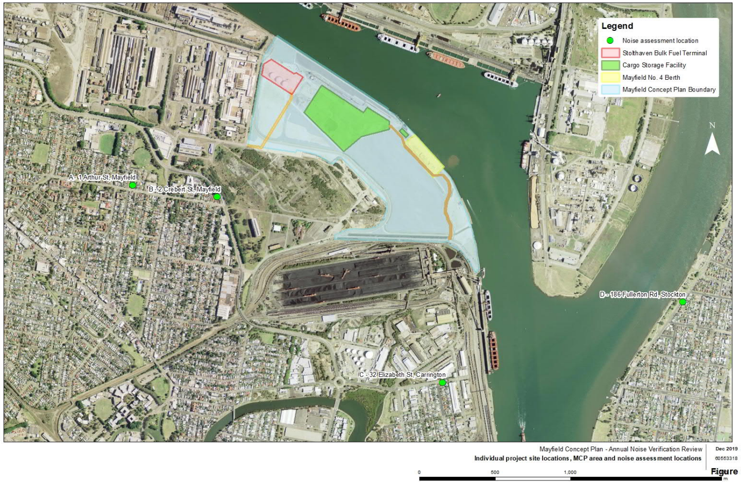
Figure 1 MCP area, project locations and noise verification locations