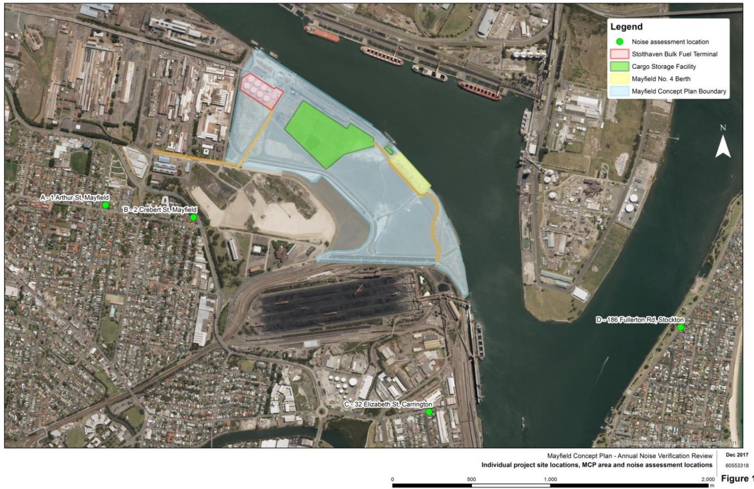
Figure 1 MCP area, project locations and noise verification locations