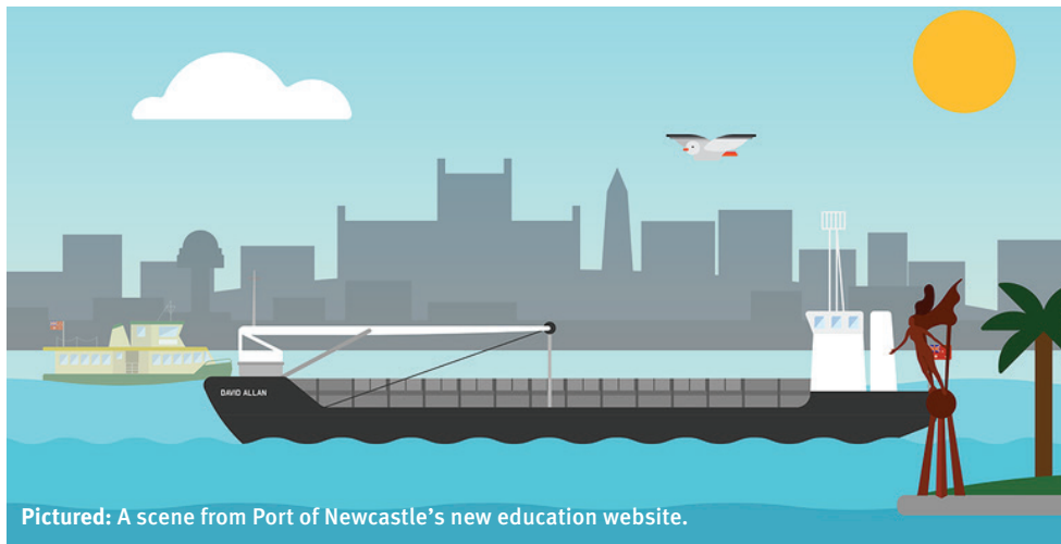
Pictured: A scene from Port of Newcastle's new education website.