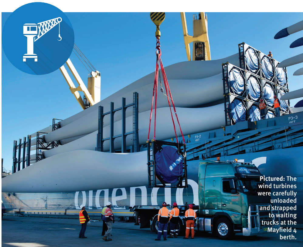
Pictured: The wind turbines were carefully unloaded and strapped to waiting trucks at the Mayfield 4 berth.