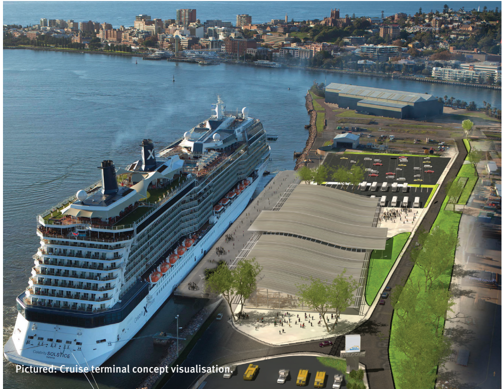
Pictured: Cruise terminal concept visualisation.

The funding will enable the construction of a purpose-built terminal of approximately 3,000 square metres and a car park. It will