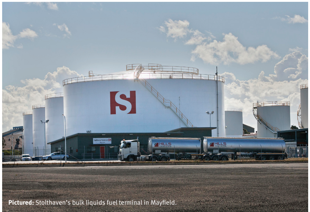
Pictured: Stolthaven's bulk liquids fuel terminal in Mayfield.

The development of fuel import facilities at Australian ports is becoming increasingly important for securing fuel supply for industrial, commercial and domestic use, given the closure of several Australian fuel refineries.