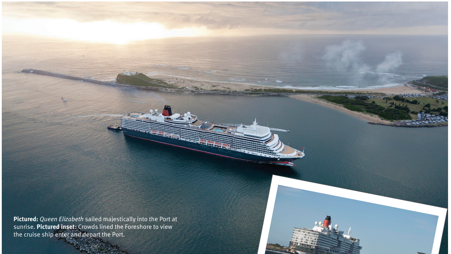
Pictured: Queen Elizabeth sailed majestically into the Port at sunrise. Pictured inset: Crowds lined the Foreshore to view the cruise ship enter and depart the Port.